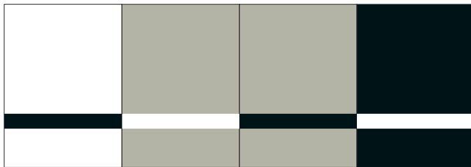
8X2-244 Winter White/ Black