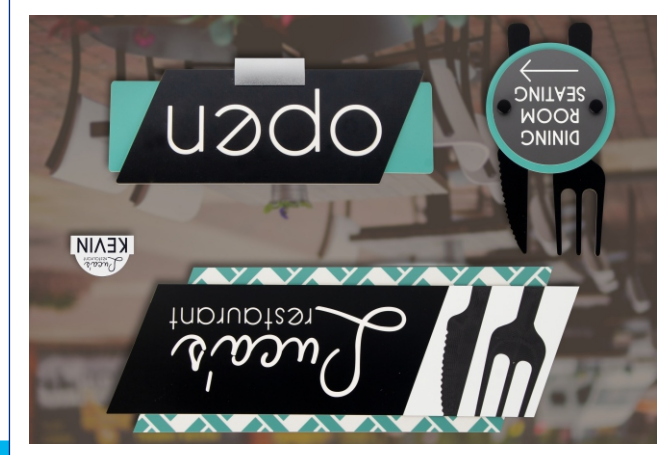
Satins Sign Kit

To request a sample or promotional literature, please call 1-877-ROWMARK (419-429-3160) or email samples@rowmark.com . For technical assistance, call 1-877-ROWMARK (419-429-3160), visit www.rowmark.com or email inquiries@rowmark.com .