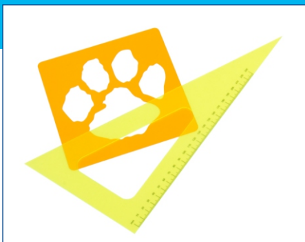
^ Lucent application examples