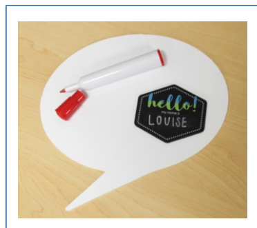
Message Board chalkboard » and dry erase application examples