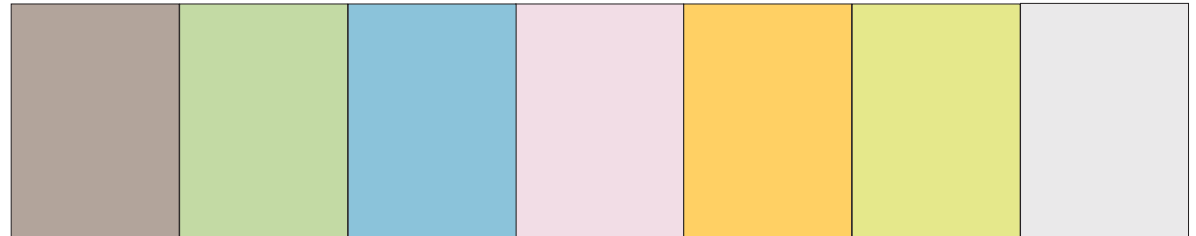
LC342-025 Translucent Smoke

Great for stencils and templates, Lucent by Rowmark is a thin, modified acrylic plastic that can be easily fabricated using standard industry tools.