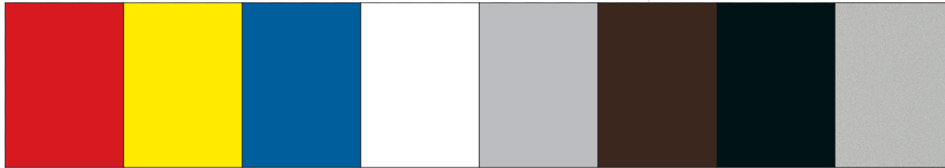
LM922-601 Matte/ Crimson

Create striking, crisp images with all-new Lasermax® Reverse Light Blockers. This product is perfect for applications that require images to be protected subsurface, allowing for a smooth top surface that can be easily cleaned. LaserMax® Reverse Light Blockers are a perfect choice when looking for a custom color combination. Use the standard range of colors and your choice of acrylic paint to meet custom needs. This line is also ADA compliant and UV-LED print receptive.