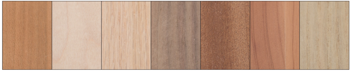
RW1X24-XXXCHE* Cherry RW1X24-XXXMAP* Maple RW1X24-XXXOAK* Red Oak RW1X24-XXXWAL* Walnut RW1X24-XXXMAH* Mahogany RW1X24-XXXCED* Cedar RW1X24-XXXSAS* Sassafras