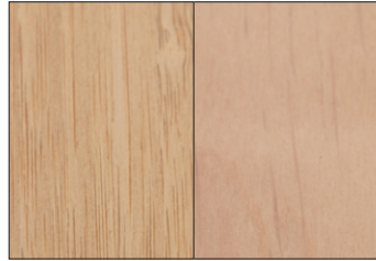
RW1X24-XXXBAM* Bamboo RW1X24-XXXALD* Red Alder

The laserable wood material that meets just about any fabrication or application need! Rowmark's Hardwood Collection is constructed of five single-ply, high quality hardwood layers (or veneers) that are laminated together with their wood grains stacked at right angles to each other for added strength, stiffness and dimensional stability.