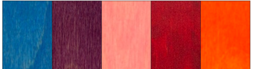
CW12XX-125BLJ Blue Jay CW12XX-125PLM Plum CW12XX-125BLS Blush CW12XX-125CAR Cardinal CW12XX-125CLM Clementine

Available exclusively from Rowmark, this line features all-natural birch stained in vibrant colors that are suitable for laser or rotary engraving or UV-LED printing. Available in 20 unique colors in either 12" x 12" or 12" x 24" sizes, our colorful wood line of products provides a contemporary yet vintage look to any project.